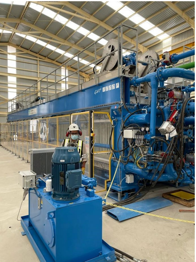
Filtration Plant Press