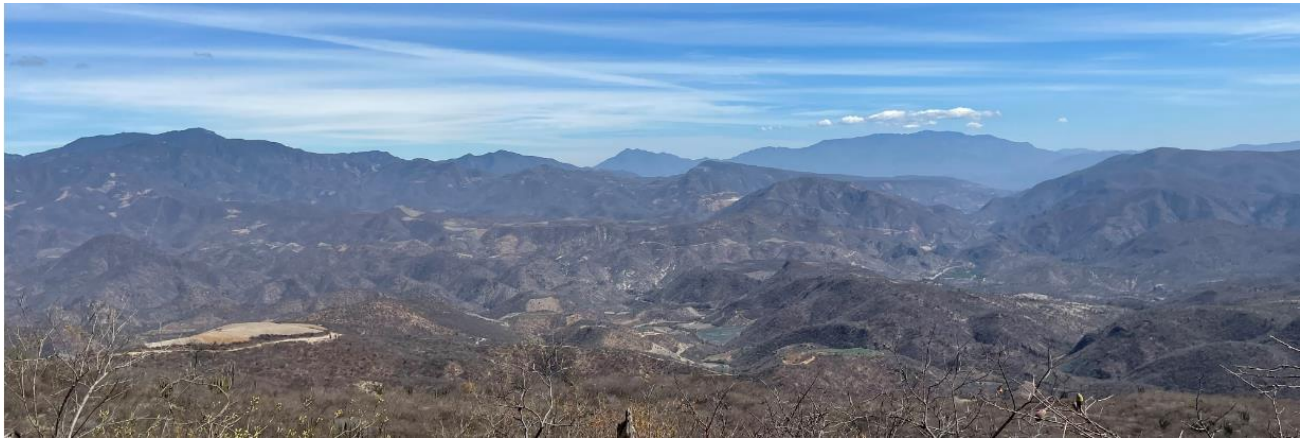
View from Alta Gracia southeast towards Arista

Within the 55-kilometer-long San Jose structural corridor, in Oaxaca, Mexico, sits a highly prospective ground package. Multiple volcanic domes of various scales, and likely non-vented intrusive domes, dominate the district geology. These volcanogenic features are imposed on a pre-volcanic basement of sedimentary rocks. Gold and silver, as well as base metal mineralization in this district is related to the manifestations of this classic volcanogenic system and is considered epithermal in character. The Company intends to advance organic growth and to unlock the value of the mine, existing infrastructure, and our large property position by continuing to invest in exploration and development. Please see Item 2. Properties for additional information.