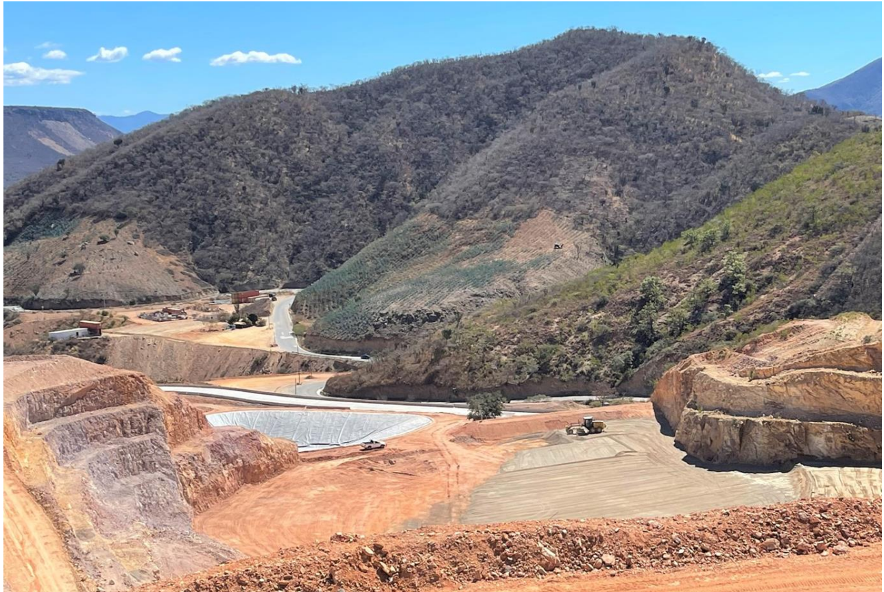
Open Pit and Dry Stack Facility

Exploration Activities: The 2021 Alta Gracia exploration program mainly included surface geological mapping along with rock chip sampling in the historic mining areas at Alta Gracia. The new information will be used to guide future surface drilling programs.