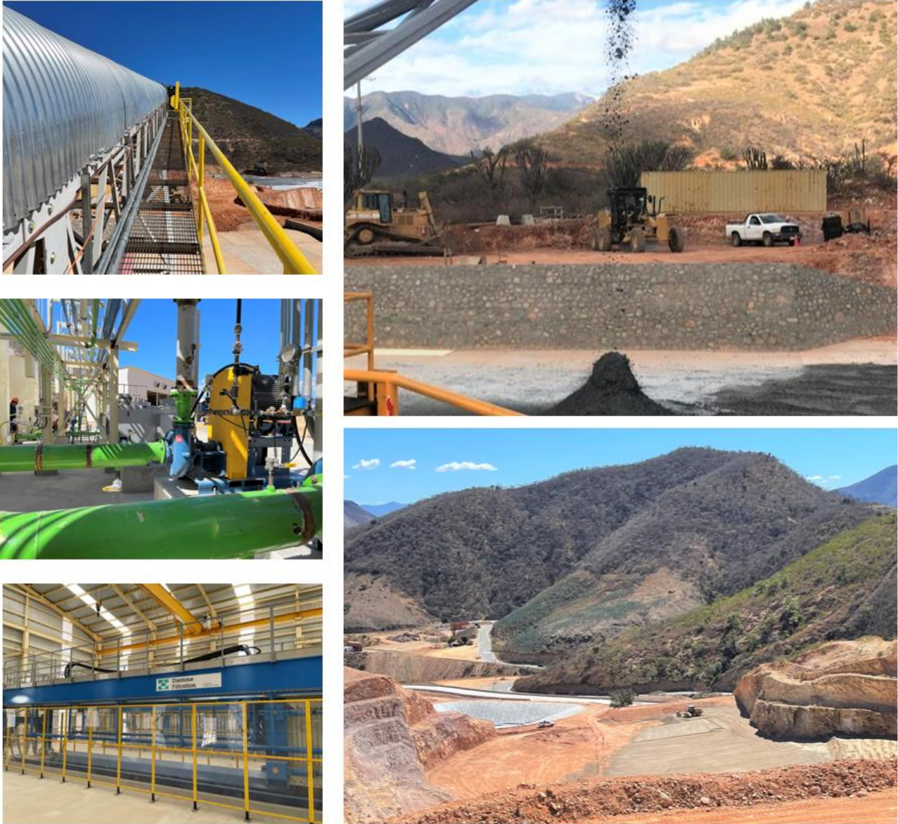
Dry Stack Tailings Filtration Plant and Dry Stack Area

Dry Stack Tailings Project: Construction and commissioning of the filtration plant and dry stack tailings project is complete. The dry stacked tailings will accelerate reclamation of certain areas of the open pit mine, extend the life of the existing tailings and storage facilities, and significantly reduce water consumption as approximately 80% of the process water will be available for reuse. As of December 31, 2021, $14 million has been invested in this project.