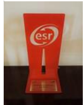
Seventh consecutive ESR award

We completed 112 underground diamond drill holes totaling 25,104 meters and 30 surface diamond drill holes totaling 9,930 meters at the Arista mine during 2021. Our exploration activities were mainly focused on exploration drilling at the Arista and Switchback vein systems in the Arista Mine. The Switchback drill program targeted the expansion and delineation of multiple high-grade parallel veins to define additional Mineral Reserves and optimize the mine plan. Likewise, we continued to explore for extensions of the Arista vein system currently in production. Surface geologic mapping and rock chip sampling also continued in the vicinity of the Arista Mine, the DDGM open pit, and the geological targets Cerro Pilon and Cerro Colorado among other prospects. Our exploration efforts demonstrate our commitment to long-term investment in Oaxaca, Mexico.